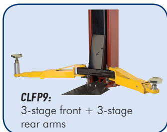
CLFP9: 3-stage front + 3-stage rear arms

The CLFP9 features a 10' 7/8" overall column height, making it ideal for low ceiling applications. Standard front and rear 3-stage arms provide maximum arm sweep, arm retraction and reach. CLFP9 will accommodate a wide variety of vehicle lifting points, including short and long wheelbase and wide body imports.