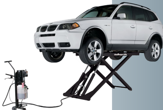
Model#: MR6 Portable Mid-Rise Lift 6,000 lb. capacity

Exclusive features include a sliding/rotating arm design with rubber pads, low drive-over clearance, and much more.